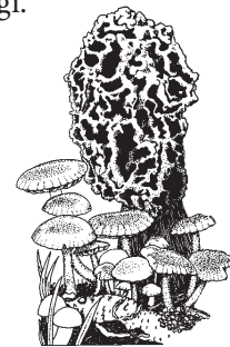
Morel and other small mushrooms.

Mushrooms don't always look like mushrooms! The apricot jelly fungus, Phlogiotis helvelloides is common in the fall and looks like little lobes of apricot coloured flesh sticking out of the gravel. In Lynn Canyon Park you can find apricot jellies on the Access Road Trail. Elphin saddle fungi, Helvella compressa are often found alongside trails, looking like little grey saddles on top of thin white stalks. The bird's nest fungus, Cyathus stercoreus is a tiny and very distinctive mushroom that looks like a little nest filled with small round eggs. When the rain hits the nest-like structure of the fungi, the little egg-like fungi pieces are splashed out of the nest and if they land in a favourable site they will develop into new Bird's Nest fungi! Explore Lynn Canyon Park and you'll be amazed at the diversity of fungi.